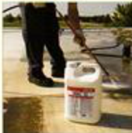
1. Power wash and clean with WAC II® roof cleaner