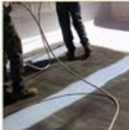
4. Seal entire roof with Rapid Roof III top coat.

*See Product Specifications for current pull-test requirements.