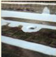
3. Reinforce seams with Spunflex® imbedded in Rapid Roof® III base coat.