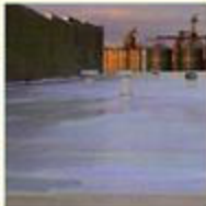
2. Prime surface with Tack Coat™ primer.